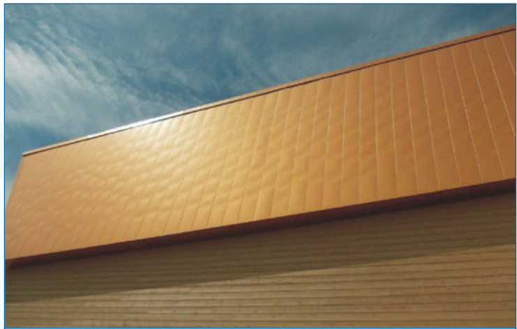
Figure 1: Oil-canning on Wall Cladding

Quality control, however, cannot end on the shop floor. The building project needs the cooperation and knowledge of everyone involved to enhance the quality of the finished job. Oil-canning is a phenomenon that can be managed if the following factors are considered at the beginning of a project.