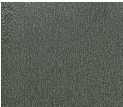
Graphite Grey QC9821