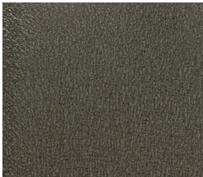
Sepia Brown QC9798