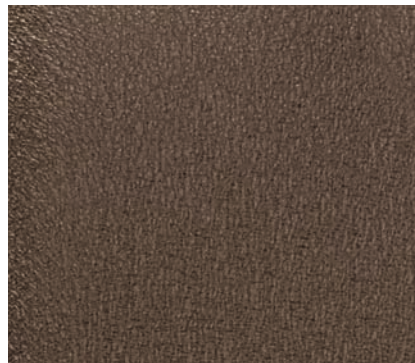
Deep Royal QC9842