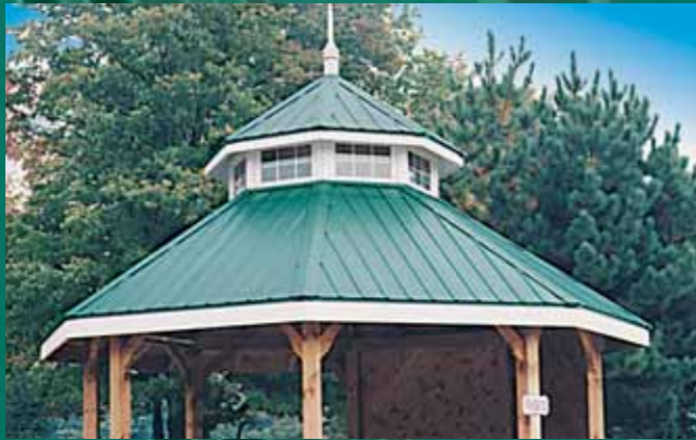
COMMERCIAL & LIGHT INDUSTRIAL