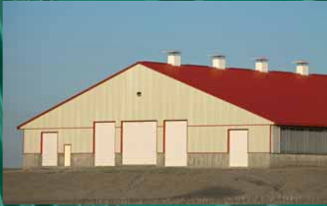
AGRICULTURAL & INTERIOR LINERS