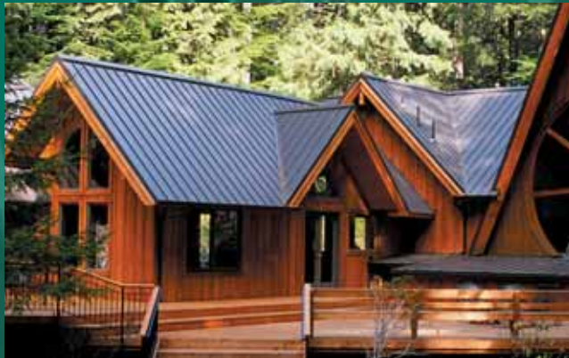
RESIDENTIAL & COTTAGES