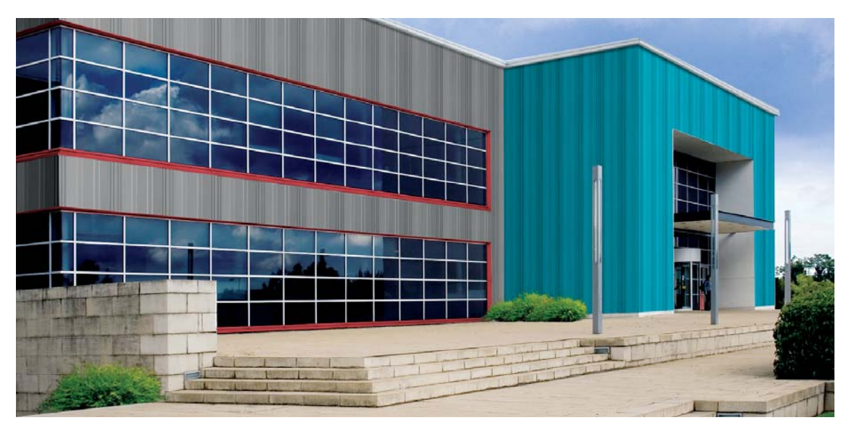
Ideal for large commercial applications. Make a statement with a variety of colour choices